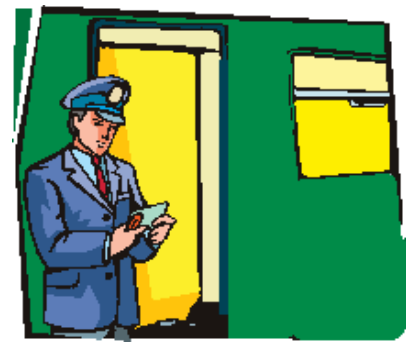
5:00 PM; goodbye