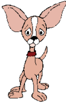
3:30 PM; goodbye

Guten Morgen - good morning Guten Tag - good afternoon Hallo - hi Auf Wiedersehen - good bye Guten Abend - good evening Tschüss - good bye