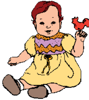
10:00 AM; greeting