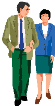
1:30 PM; greeting