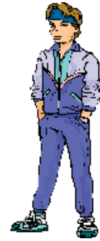
8:15 PM; greeting