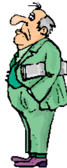
9:00 AM; greeting